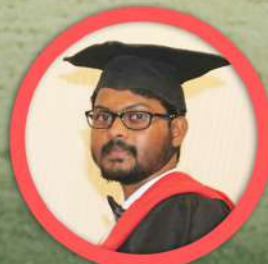
YALLA UJWAL TEJA